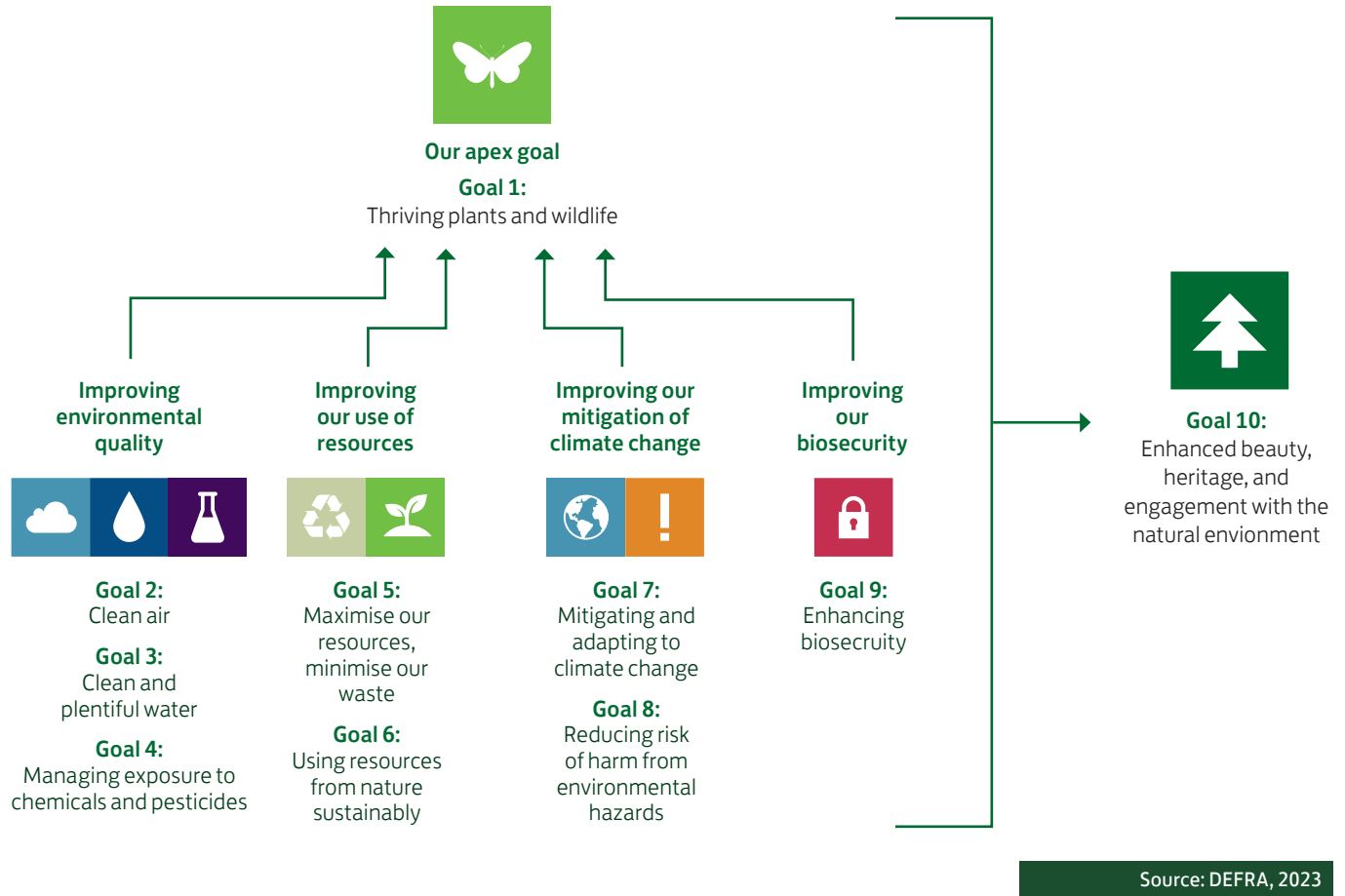
Figure 2 Links between the Environmental Action Plan 2023 environmental goals

The EIP brings together a comprehensive plan for the UK’s strategy to hit net zero commitments, the COP26 pledge to halt deforestation and land degradation by 2030, and more recently, the agreement to halt and reverse biodiversity loss by the end of the decade at the UN Nature Summit COP15.