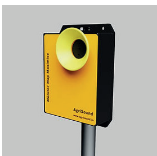
Figure 4: Agrisound’s “Polly” pollinator monitor

With the introduction of biodiversity net gain credits, natural capital reporting, and the new UK National Pollinator Strategy, Agrisound is afforded a number of huge market opportunities via recent policy changes. Indeed, the company is currently in talks with The Department for the Environment, Food and Rural Affairs (DEFRA), to understand if its remote pollinator recording could be used as an addition to the “Defra Biodiversity Metric Assessment” ecological survey. The latter must be done by a registered ecologist and is therefore highly labour intensive and costly. On the other hand, Agrisound’s technology can record biodiversity in real time and with almost no labour other than placing the recording devices at specified locations. In this way, when recording how many biodiversity net gain credits a land parcel has produced, the recording technology would greatly complement the ecological survey.